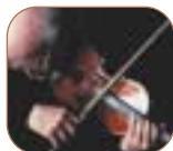
Broadcast Stereo Sound